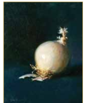
WHITE ONION, Shira Friedman, Oil on panel, 10 x 8 in.