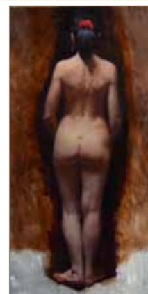
UNTITLED, Oil on linen, 16 x 8 inches