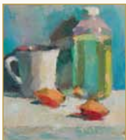
DRIED ETROGS. Oil on canvas, 12 x 9 inches

But, he wanted to do more and a Philadelphia Inquirer article about an art studio teaching painting and drawing from life, lured him to the new school.