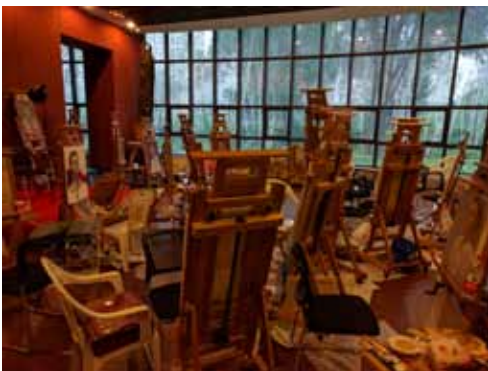
The workshop space in the Museum of Song Yugu, where the entire event took place.