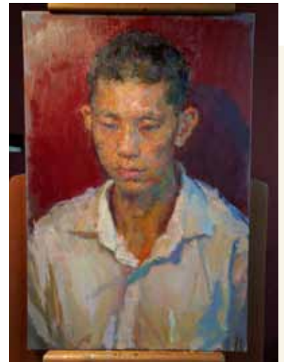
The demonstration portrait is currently on temporary loan to the Museum on Song Yu Gui, in Shenyang, China.