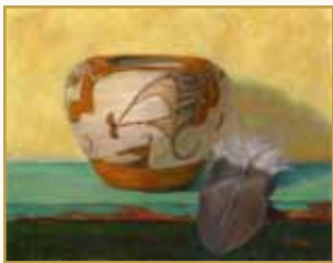
PUEBLO POT AND EAGLE FEATHER, Oil on birch, 7 x 9 inches

"I had always wanted to pursue visual arts," she says. "And, when I finally did, it was love at first