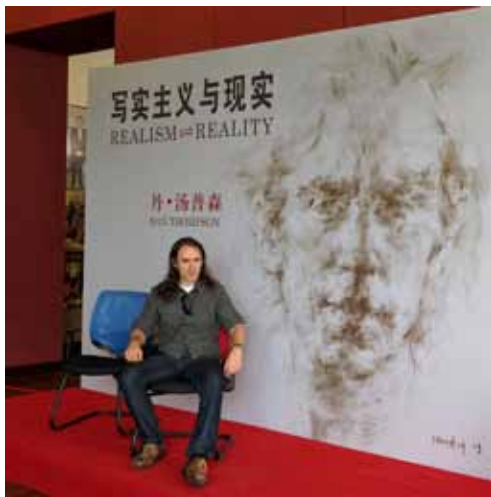
The “DIALOG-PEAK” symposium in Shenyang, China, (also called “Realism ⇌ Reality”), included an in stage interview and audience Q & A.

“There was also a lot of interest in the way paintings are constructed, the fundamental materials such as rabbit skin glue and flake white,” he said. “We seemed to have one long conversation about how to build a painting, from the ground up.”