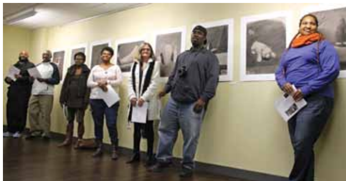
Project HOME artists

Ciao Philadelphia celebration to hold an event featuring the history of costume portraiture complete with a media presentation and a live-model demo with expert commentary. Halfway across the country, our