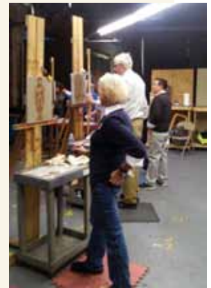
Members of the Rotary Club of Philadelphia enjoyed an Evening of Painting while raising money for the organization’s efforts to eradicate polio around the world.

Studio Incamminati is recognized as a nonprofit organization under Chapter 501(c)(3) of the Internal Revenue Code.