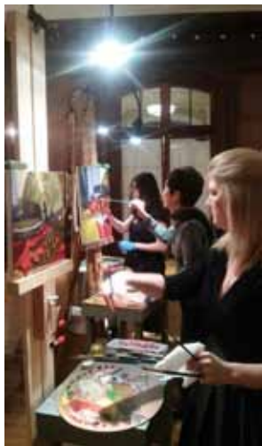
(Above and left) Studio Incamminati artists perform painting demonstration for PYO guests as they mingle and enjoy the exhibition and sale of artwork.