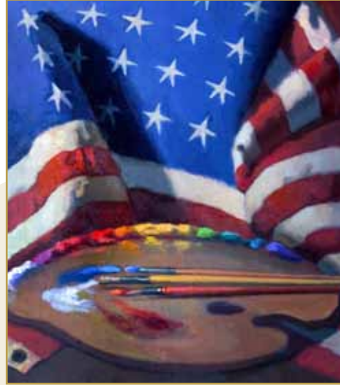
RED, WHITE & BLUE by Leona Shanks; Oil on linen; 2015; 16 x 14 inches