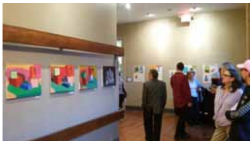
High school students exhibit their work at the annual exhibition at Doane Academy, Studio Incamminati's secondary school partner.