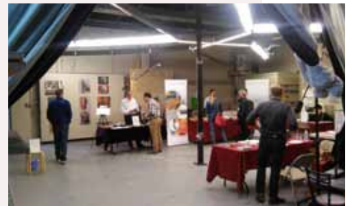
At Studio Incamminati's spring Open House, visitors enjoyed free samples from vendors (above), and painting demonstrations and conversations with artists (below).