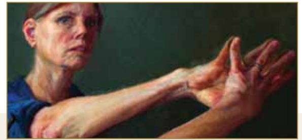
▲ PUSH; Lea Colie Wight ; Oil on linen; 10 x 20 inches