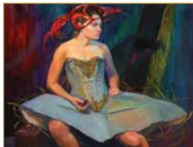
BEFORE FLIGHT, Oil on linen, 30 x 20 inches